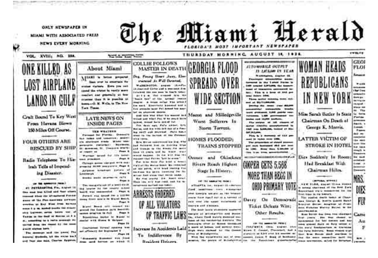
Front Page News in Miami the Following Day

* Reprinted with permission of the author. The original appears in the April - June 2014 issue of the Bulletin of the Metropolitan Air Post Society.