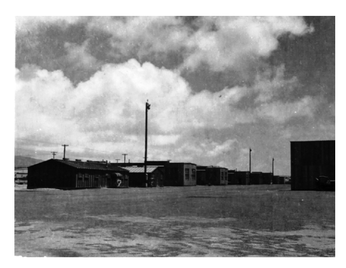
The first shelters on the field had been tents, and the first

<sup>4</sup> 1391st Army Air Forces Base Unit Project Engineer Historical Reports, and Historical Report, North Atlantic Wing, Air Transport Command, 1 October 1944-1 October 1945 (Air Force Historical Research Agency call number 303.01, Oct 1944-Oct 1945, vol. 1, IRIS