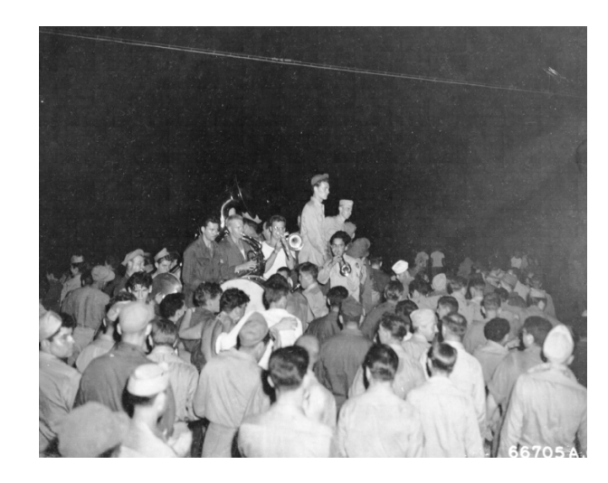
8 Civilian Personnel Report to Historical Officer, 1391st Army Air Forces Base Unit, September 1945.

Gradually, the base became more military than civilian. In mid-May, when Santa Maria Airfield became operational, there were 1,026 American civilians and 1,282 Portuguese on the base, but military strength had increased to 130 officers and 1,445 enlisted personnel.<sup>5</sup> By the end of June 1945, there were only 328 Portuguese still on the site, and all but 27 of the American civilians had been sent back to the United States.<sup>6</sup> Military strength increased until in August, there were more than 1,500 enlisted men and officers.<sup>7</sup> However, the end of the war in Asia later that summer reduced the military personnel on the base, and the places of many of them were refilled by Portuguese workers. By the end of September, there were nearly a thousand of them.<sup>8</sup>