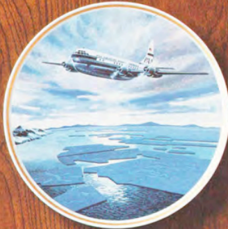
PLATE 1: A Stratocruiser spans the Antarctica

A FINE ARTIST HAS CAPTURED SIX EXCITING MOMENTS IN THE HISTORY OF TRANS-OCEANIC FLIGHT.