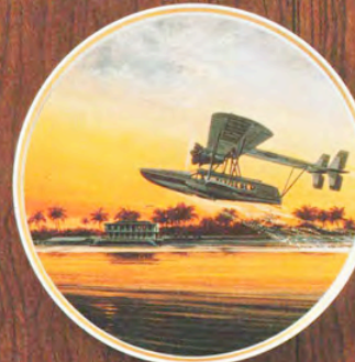
PLATE 5: Col. Lindbergh's first official flight for PAN AM