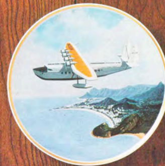
PLATE 3: "Flying down to Rio"