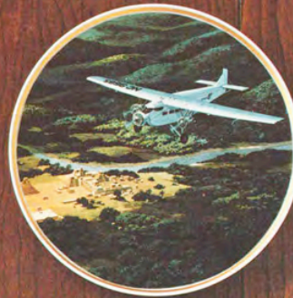
PLATE 4: A "Tin-Goose" over the Mayan ruins