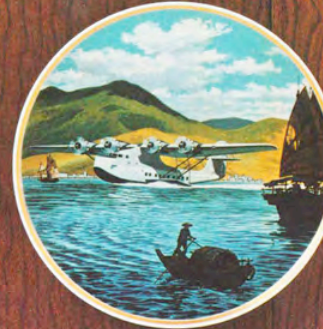
PLATE 6: "China Clipper" lands in Hong Kong harbor

A COLLECTOR SERIES DEDICATED TO THE AVIATION PIONEERS WHO ESTABLISHED TRANS-OCEANIC AIR TRAVEL.