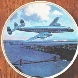
PLATE 2: A "Constellation" circles the globe