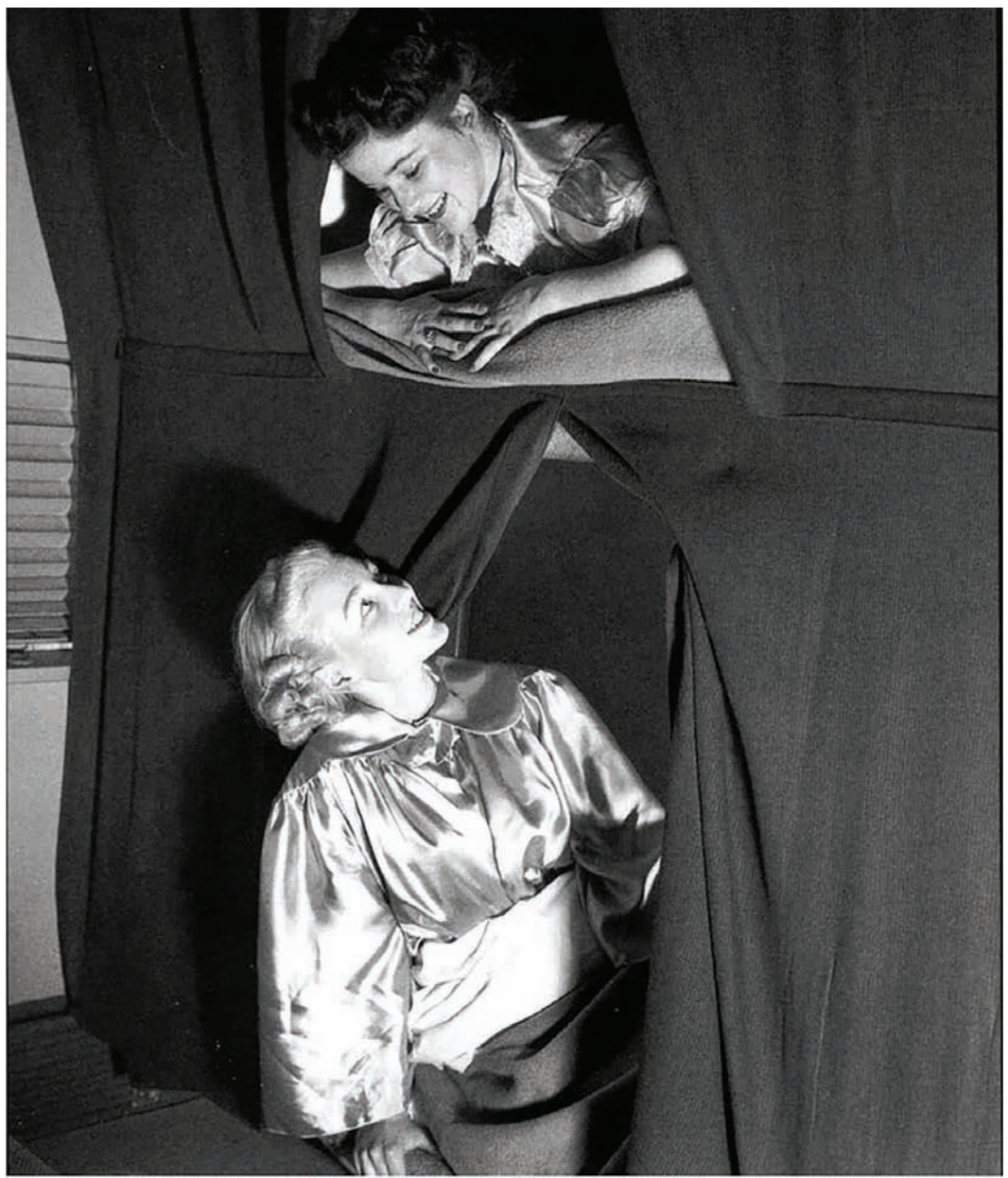
BOEING B-314 BERTHS

Throughout the 1930s Pan Am's determination to span the Atlantic and Pacific kept the airline operation in an almost constant state of flux. It was constantly pursuing new aircraft models with more range, developing procedures to cope with weather and sea condition forecasting for long range flights, and providing maintenance and logistics support in remote areas throughout the world. The thrust to forge these uncharted oceanic routes and new destinations utilizing evolving aircraft models with improved technology was an extraordinary operating challenge.