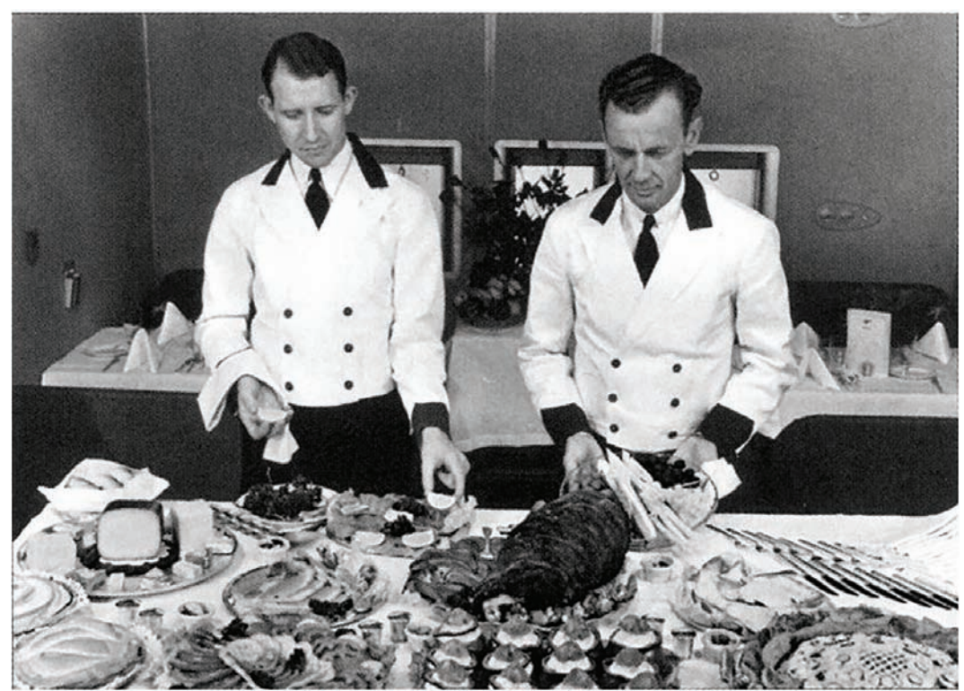
BOEING B-314 DINNER SERVICE

Preparing for the final day's flight from Trinidad to Miami, on the President's birthday, we got a nice birthday cake for him and 'dressed' the aircraft with signal pennants which read 'Happy Birthday Chief.'