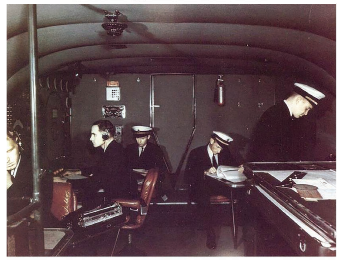
B-314 flight deck